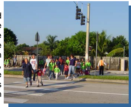
Walk to School events help promote safe walking practices for school aged children

Building a bike-friendly community makes it easier for more people to get around and stay healthy. To learn more about the Bicycle/Pedestrian Program visit: www.miamidade.gov/mpo