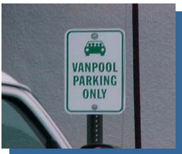
The South Florida Vanpool Program can be reached at 1-800-234-RIDE (7433)

Currently, the program allows a $400 subsidy per vehicle per month. The balance of the cost is shared by all members of the group, except the volunteer driver. Direct costs such as gasoline, parking, and tolls are shared. The monthly fee includes the lease of the vans, insurance (no-deductible), and all scheduled and unscheduled maintenance.