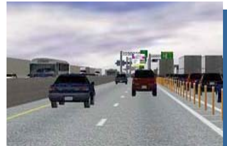
Two express lanes along I-95 separated by delineators from the general purpose lanes

The lanes are managed through congestion-priced tolls that will vary depending on given levels of traffic demand in the general purpose lanes. Vehicles in the express lanes will operate at between 45-50 MPH even during peak periods. Learn more at www.95Express.com .